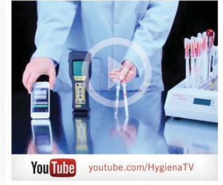
Watch an instructional demo at youtube.com/HygieneTV

MicroSnap E. coli is a rapid test for detection and enumeration of Escherichia coli . The test uses a novel bioluminescent reaction that generates light when enzymes that are characteristic of E. coli bacteria react with specialized substrates. The light generating signal is then quantified in the EnSURE luminometer. Results are available in 8 hours or less, depending upon required level of detection. Single figure organisms can be detected in 8 hours, delivering results in the same working day or shift.