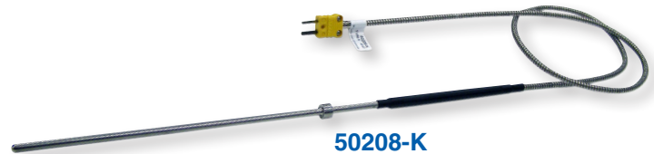
50208-K Fry Vat Probe