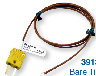
39138-K Bare Tip Probe