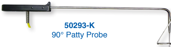
50293-K 90° Patty Probe