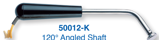
50012-K 120° Angled Shaft Surface Bell Probe