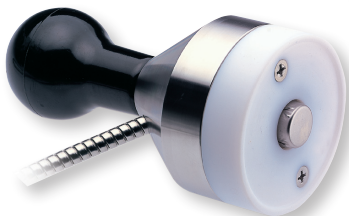
50014-K Weighted Griddle Surface Probe